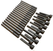
Ejector Rods & Heads: All standard machine sizes + custom rods/heads