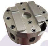
CNC heads: 50/100 vintage and new styles (dovetail & extended) available + CNC head rebuilds